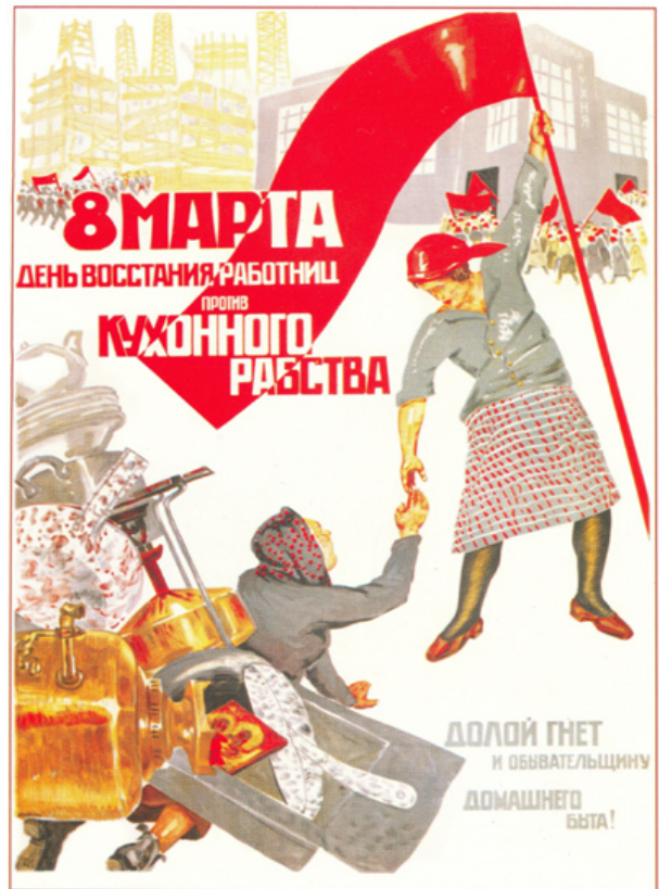
1920s Soviet Posters for International Women's Day

The modern woman, wearing a red doek, leads another woman out of drudgery.